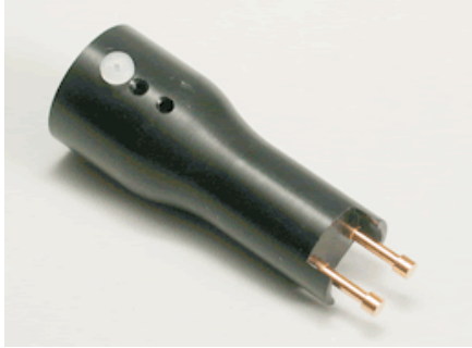
Item Number PRF-922A