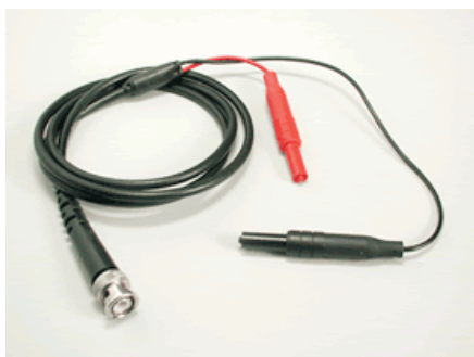
Item Number PRF-912AL