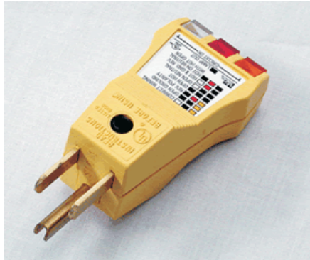
Item Number GAP-005