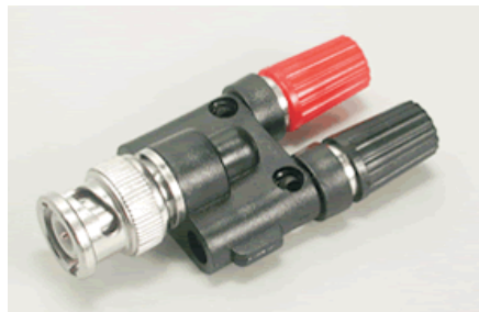
Item Number GAP-005