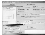
Figure 1 - ZeroStat® MTR-8700 Combo-Tester Station

Shown below is the more advance MTR-8900 Combination Tester with automated tracking software