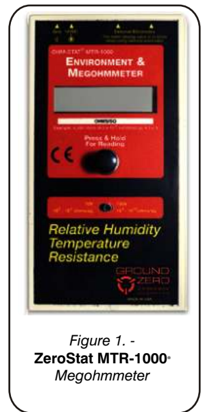
Figure 1. - ZeroStat MTR-1000® Megohmmeter

All materials must be tested on an insulated surface to avoid misleading measurements. It is possible to measure down through the surface and not along the surface. This is especially true with non-homogeneous or multilayer materials. It is possible to actually measure down through the dissipative surface layer and along the inner conductive surface and back up through the dissipative layer. This is why it is not technically correct to include a surface measurement value for two layer materials. Always measure material thickness when measuring electrical properties because thickness, temperature, and relative humidity can and will affect the resistance/resistivity readings.