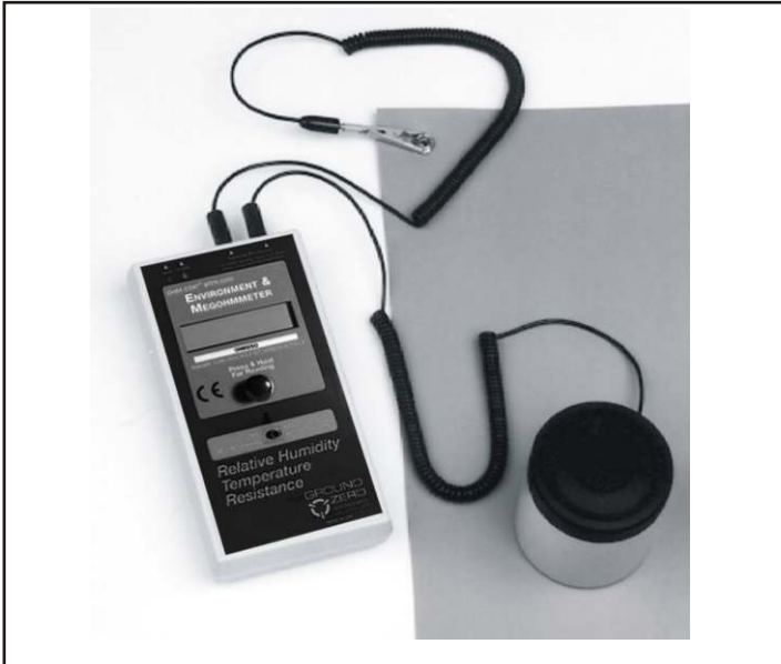
Figure 4 - ZeroStat MTR-1000 Point-to-Point Test