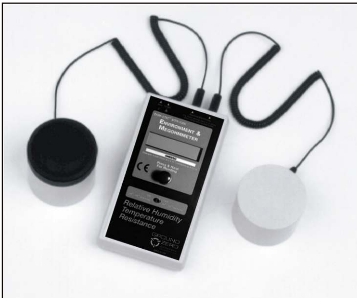
Figure 5 - ZeroStat MTR-1000 Point-to-Ground Test