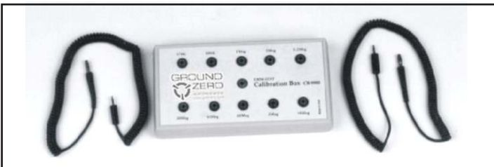
Figure 6 - ZeroStat CB-9900 Calibration Box

The ZeroStat®MTR-1000 requires no service or maintenance except for an occasional cleaning of the rubber on the probes. A mild soap and water solution will remove dirt or other harmful contaminants from both the rubber probes and the meter case. Harsher solvents will affect the rubber probes and therefore should not be used. When the meter is not used for extended periods of time, remove the battery to prevent damage and/or leakage. The ZeroStat®MTR-1000 is calibrated to NIST traceable standards at the factory. The calibration is done by using a computer program and 1% resistors. This newly improved method assures many years of long life and accurate readings. Attaching 1% resistors to the probes or test leads will verify this accuracy.