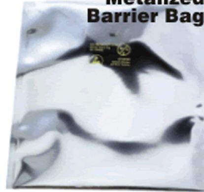
Item Number SB-2700 (W" x L")

Moisture Barrier Bag with Humidity Indicator Card and Desiccant